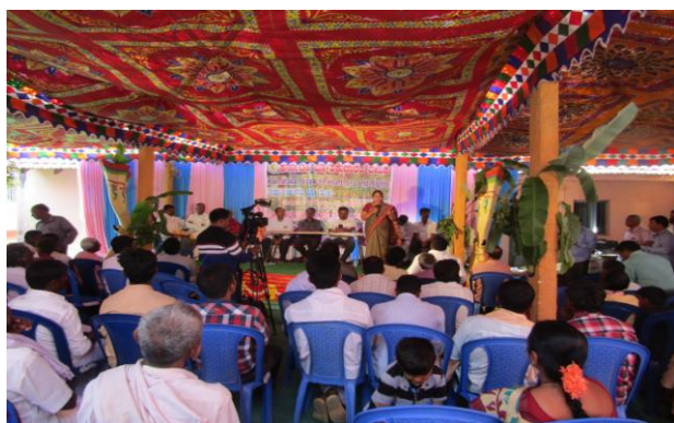
Conducting State Level Seed Mela at Shivananda Ashrama, Ajjampura