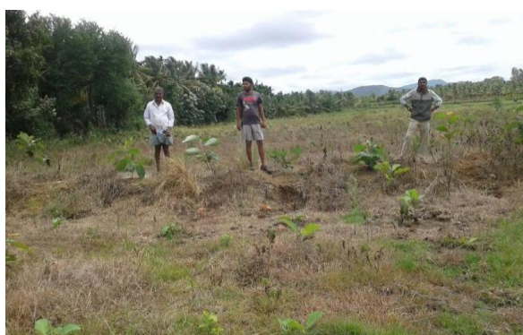
Vertical growth tree plantation under Krushi araya protsaha scheme