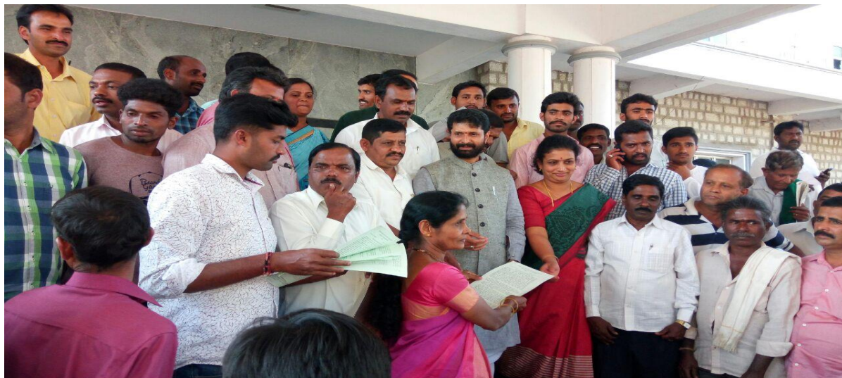
BHC and FRC cultivators memorandum submitted to MLA, Revenue Ministers and Government officers