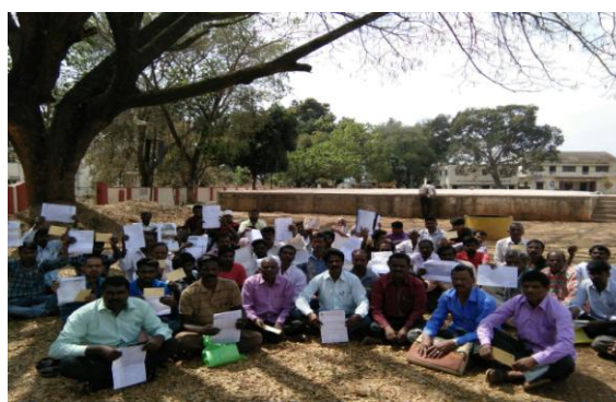
Conducting BHC and FRC district level forum members meeting