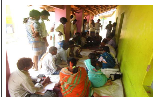
Youth sensitization Training on Seed treatment and mixed cropping system