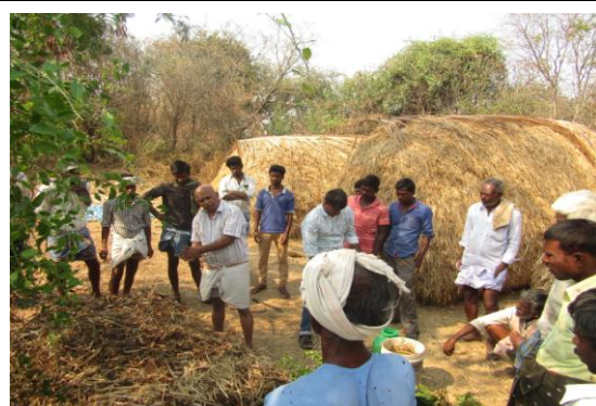
Demonstration of compost produce and training programme