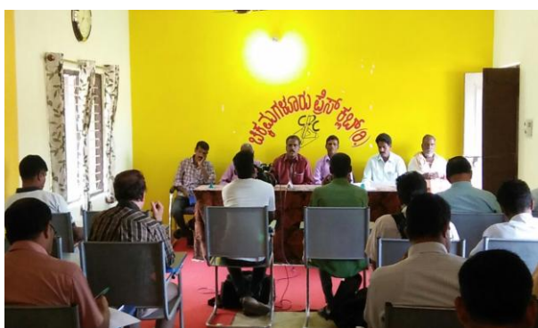
Conducting Press meet at District press club