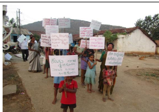
Healthy soil jatha at various villages