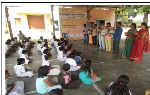
Conducting healthy soil and organic farming related drama

Due to series of awareness, training programmes and demonstration intervention 111 farmers adopted Diversity Based Ecological Farming Systems and successfully grown chemical free Ragi and other food crops (Uchchellu, Navane, Saame, Jovar, Sajje and Sasive). Farmers are happy to cultivate mixed crops and experienced high yield productivity compared to other farmers. 99 Farmers were received drums after training/orientation and now they are producing JEEVAAMRUTHA and PANCHAGAVYA (liquid manure). As a result, 60% cost invested in purchasing of chemical fertilizer has been saved. 10 School kitchen gardens are developed and continuously producing varieties of vegetables which used for preparation of mid-day meals. 230 Families are grown fresh and nutritious vegetables from their own kitchen garden which saved Rs.400 spent on purchase of vegetables every month. Besides, seed meal, makkala habba, jatha and street play shows were also implemented under the project. The programme team is also actively working for resolving local issues such as effectiveness in public distribution system, drinking water problems and connecting to government schemes for rural people are other key activities of this project.