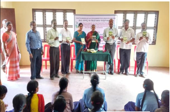
CD release function on "Our School Our Environment" Documentary film