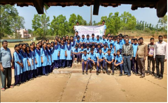
Group photos after watching video Documentary