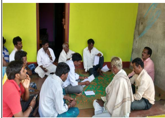
Conducting meetings with BHC and FRC