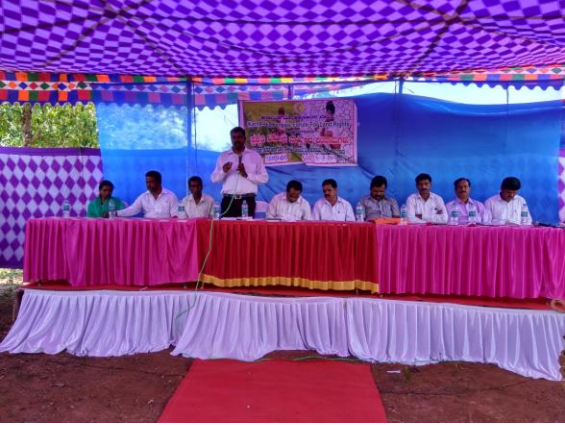
Consultative meeting with Government officials on Disaster Risk Reduction (DRR) strategies held at Mudigere taluk