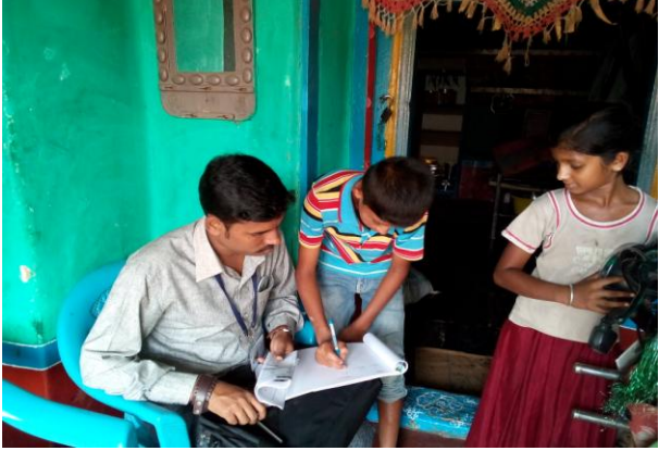
Children participation in National level Annual Status of Education Report -2016 at various villages