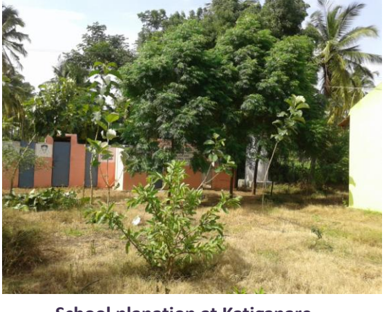
School children enjoy eating fruits