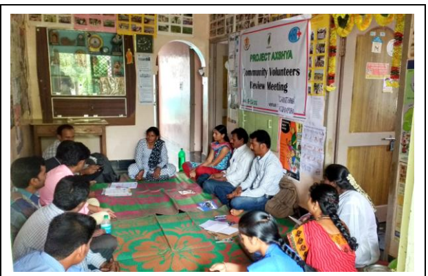
Volunteers training programme on tuberculoses at Chinthana office