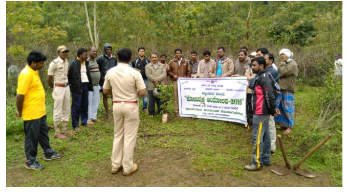
Movement of one crore tree planting campaign activity at Hannegudda hill

In order to ensure the cooperation of farmers and general public in the noble task of increasing tree cover, the implementation of Krishi Aranya Protsaha Yojane was continued by CHINTHANA FOUNDATION in Tarikere block with the support of Forest department. All together 51 farmers supported for plantation of 10000 tree plants such neem, teak and silver. As a result, farmers are coming forward for tree plantation and environment conservation.