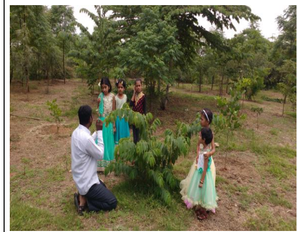
Environment education to school children at Tamatadally school