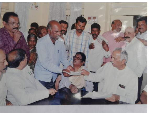
Press meet conducted on BHC and FRC and memorandum submitted to MLA, Revenue Ministers and Government officers