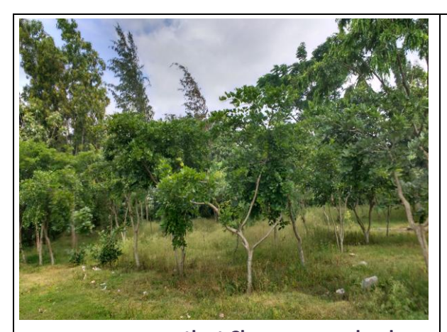
Green cover growth at Channapura school

and watering activities has contributed for the well growth of all plants in 07 school plantation. A walk into the school corridor reflects us the green coverage, fresh air and cool environment. These trees grown fast and ensured the clean and green environment to school children. Flowering and fruits among the trees as part of short impact of the intrusion was experienced. Children are enjoying the green environment and their interest increased towards environment conservation.