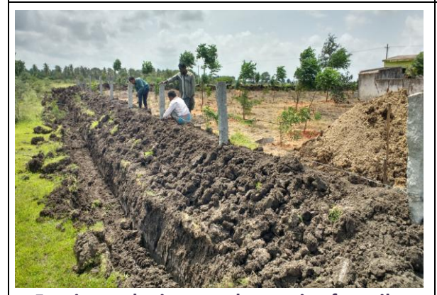
Fencing and rain water harvesting for soil and moisture conservation