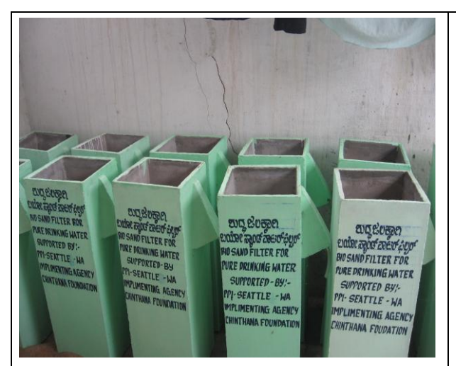
Bio sand water filters are ready to be distributed to beneficiaries