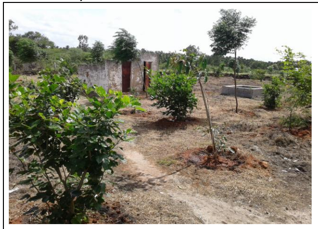
A view of tree growth at Banakunase school