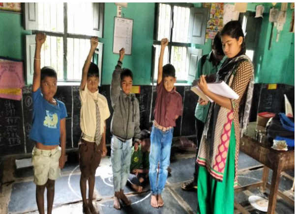
Conducted survey at Kallenahalli village