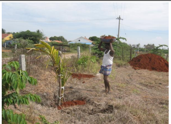
Red soil application to plants